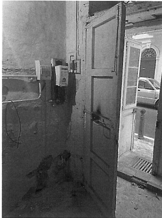
Figure 3: Separate meter for each unit

Attached photographic evidence shows that no interventions were carried out.